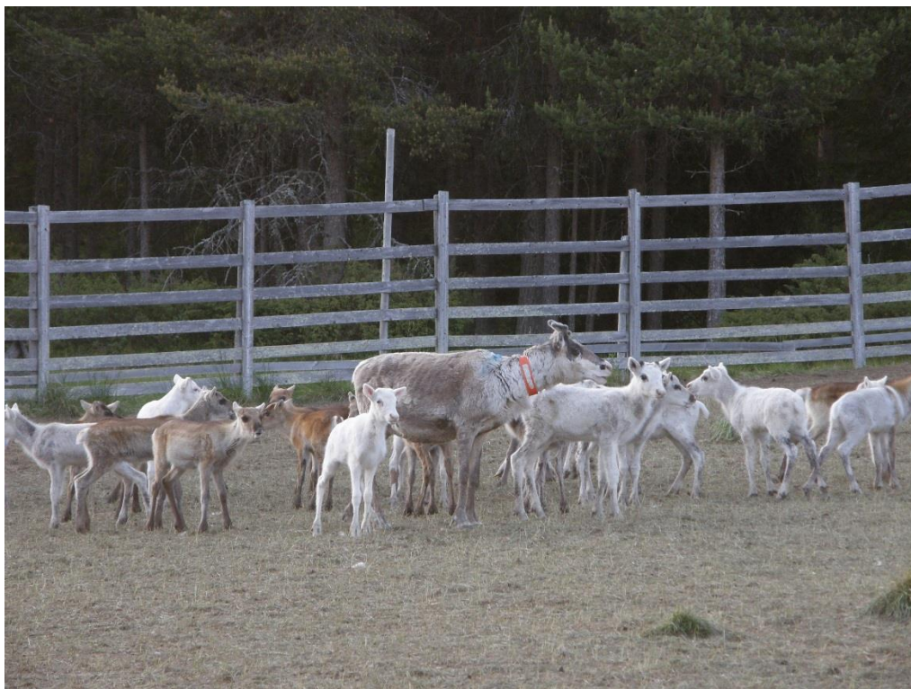
Figure 1. Several calves gathered before marking.

continuous cover forestry practices. These management practices were anticipated to benefit both reindeer husbandry and the growth of ground and arboreal lichens. Scenarios simulating these management approaches in the Malå study area showed a positive economic impact for the Sami village (Berg et al. 2016). One of the goals of the inhabitants of the Sami village is to have an economically and environmentally sustainable business. In order to achieve a sustainable reindeer husbandry business, forestry needs to be adjusted and pay attention to the needs of reindeer husbandry. This means that some specific adaptations in silvicultural management need to be taken in some areas, especially those areas which are of specific importance to the Sami village, for example areas used for the annual reindeer round-up (Figure 1), pastures for grazing and migration routes. For the forestry sector, these adjustments can however lead to a decrease in forest production as reported by Berg et al. (2016).