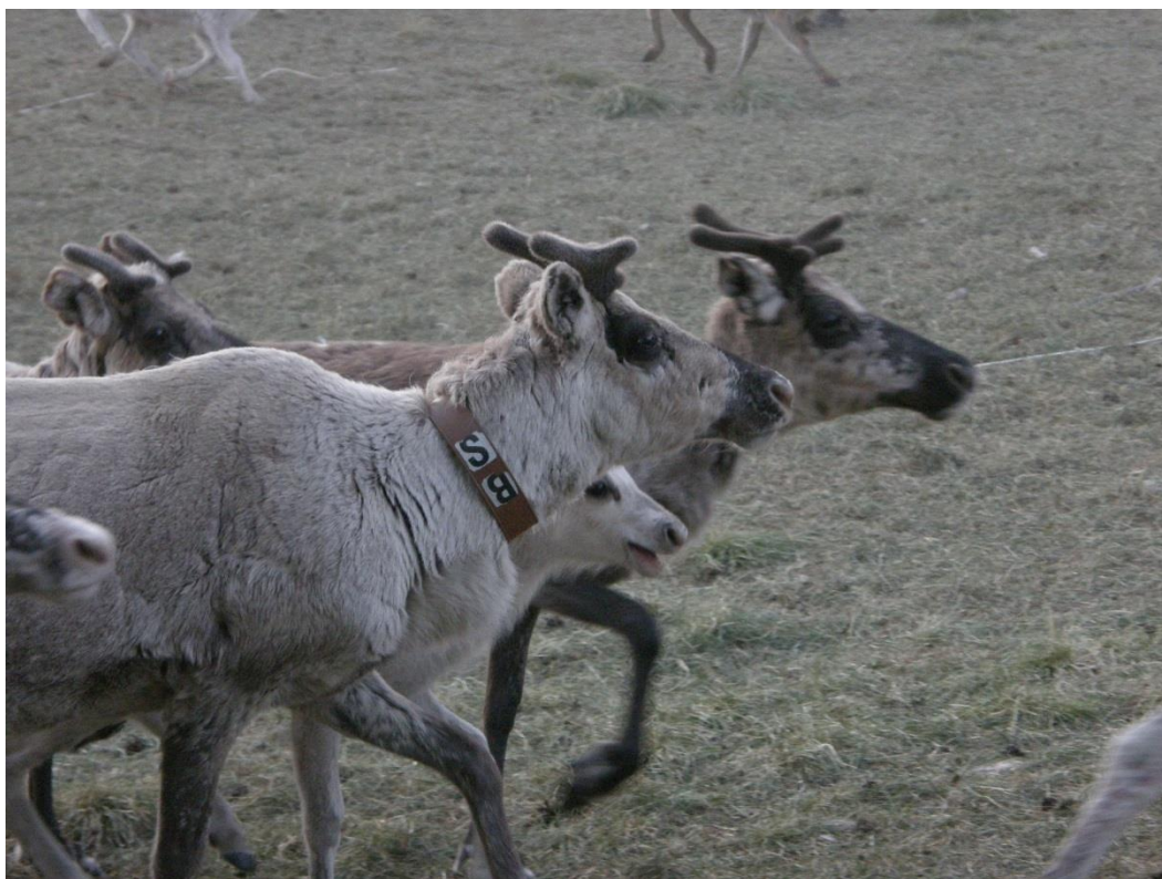
Figure 2. Female reindeer equipped with GPS collar.

The present study analyses the social, economic and environmental consequences of adapted silvicultural management and the use of GPS collars. One objective of this study was to evaluate the effects of changes in forest management on the utilization of the forests and on the grazing land for reindeer in a mountain Sami village. Another objective was to evaluate the effects of equipping part of the reindeer herd with GPS collars on the economy of a Sami village. Hopefully, the results of this study will further improve communication between different stakeholder groups in the area and show how IT tools could be used to inform decision making processes.