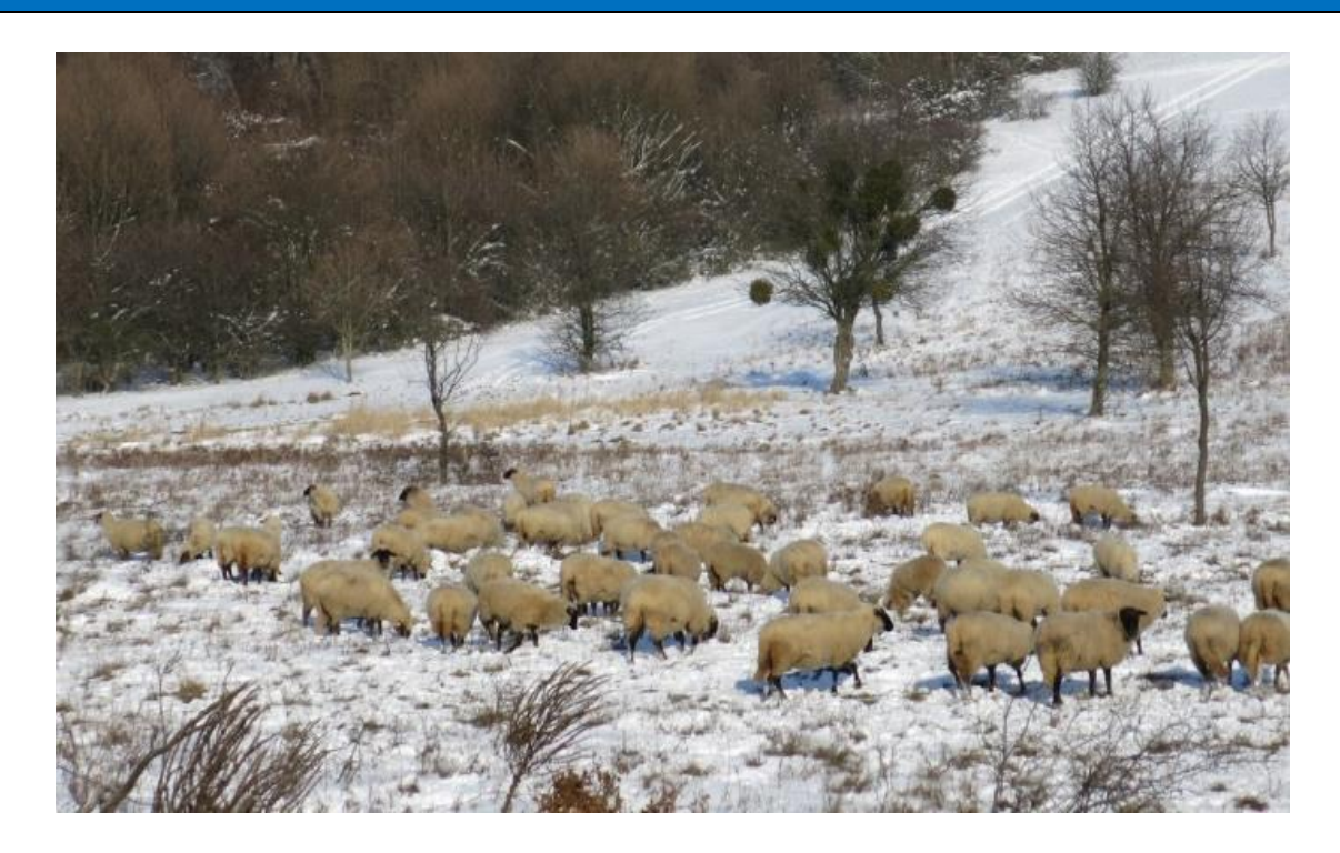
Figure 2. Sheep flock grazing over the snow in the Tűzkövesbörc Wood Pasture Farm