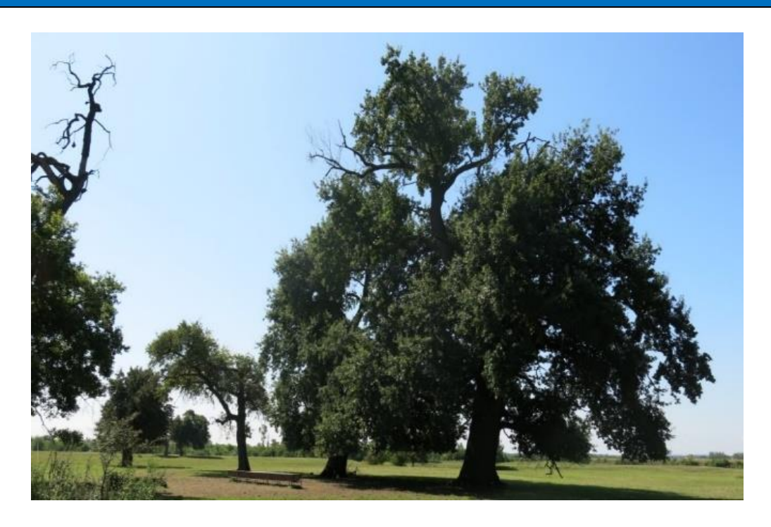
Figure 4. Image of the Bogyiszlói Wood Pasture