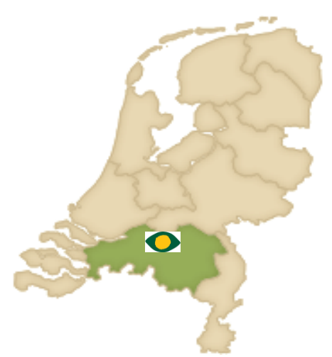
Figure 1. Location of the 'Duinboeren' in The Netherlands

Several dairy cow and goat farmers in the Netherlands were participants of the Farms' Network for Fodder Trees and Multifunctional Land Use (2012-2014). The farmers are part of a group of farmers called 'Overlegplatform Duinboeren' ("Dune farmers"), because they are located close to a nature reserve called "Loonse en Drunense Duinen". The Duinboeren is in the southern part of the Netherlands (Figure 1). During the former project four test sites with fodder trees were planted on four farms. Within the original project dairy goats were allowed to browse on fodder trees such as willow ( Salix spp) (Figure 2).