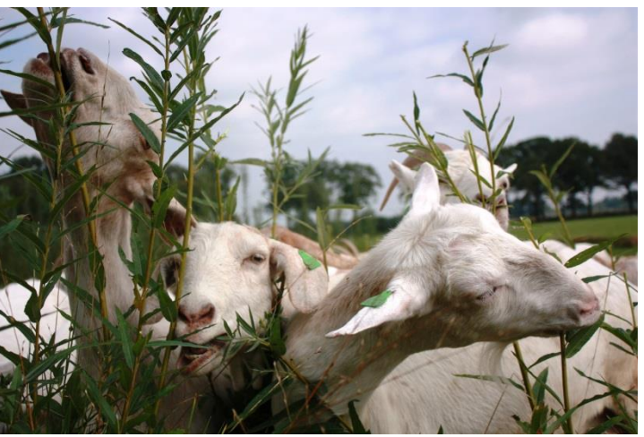
Figure 2. Dairy goats browsing on the fodder trees (willow), planted at one of the farms in Tilburg, The Netherlands.