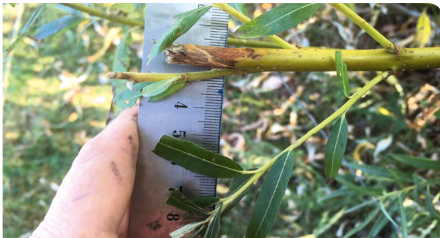
Willow twigs up to a diameter of 1 cm were browsed by dairy cows.

This leaflet is produced as part of the AGFORWARD project. Whilst the author has worked on the best information available, neither the author nor the EU shall in any event be liable for any loss, damage or injury incurred directly or indirectly in relation to the report.