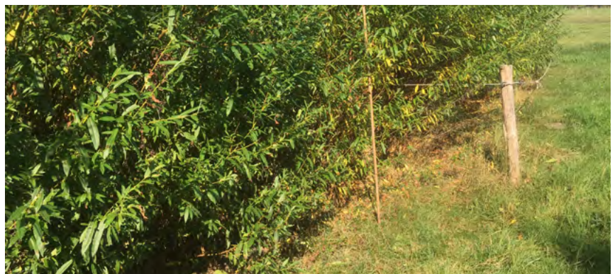
Twin rows of willow trees during a browsing experiment with dairy cows. The willows are planted on a north-south axis. In the back, an enclosure was constructed (behind the bamboo stick), where the cows were not able to browse. This picture shows the difference between browsed trees (in front of stick) and protected willow trees.