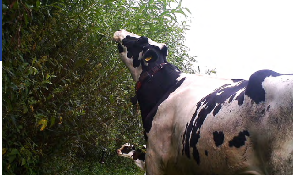
Cow and calf browsing from willow fodder trees

Selenium intake from grass, shown as a percentage of the total cattle nutrient requirements for dry and lactating cows. The 'deficit' represents the percentage that is normally covered via mineral supplements.