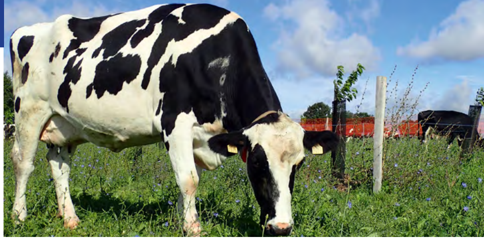
Dairy cows grazing a paddock recently planted with fodder trees