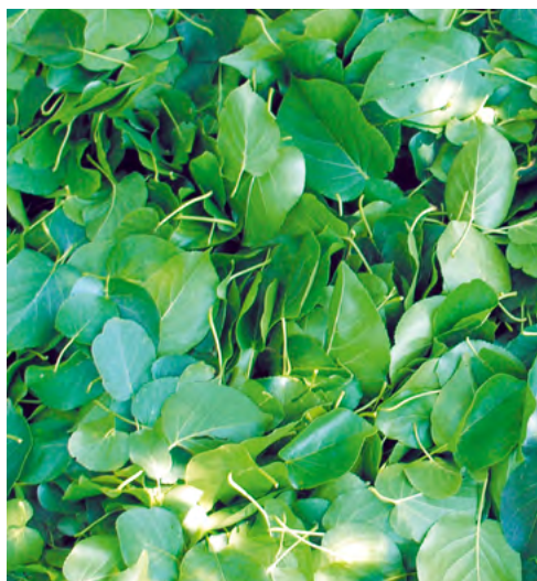
Leaves of Italian alder collected to be analysed Ref: Jean-Claude Emile