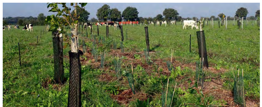
A pasture-fodder tree agroforestry demonstration paddock for ruminants in Lusignan (France)

Additionally, the nutritive value of several woody plants leaves was evaluated to determine the woody species that could be included in the diet of lactating cows.