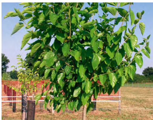
White mulberry and grassland in August 2016 Ref: Sandra Novak

Grazing is a critical aspect of energy and water-saving management. However, the quantity and quality of grazed forage are highly dependent on climatic conditions. In Atlantic French regions, grazed grasslands currently provide forage in spring and, to a lesser extent, in autumn. However, grassland production is much reduced in summer. Climate change will probably increase drought conditions in late spring and summer, and also the overall variability of grassland production annually. Trees and shrubs could provide a complementary forage resource on dairy cattle farms.